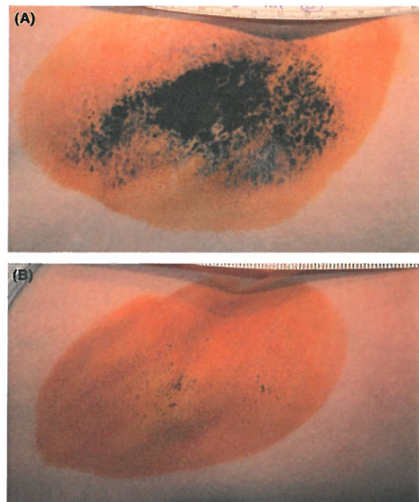
Figure 1. Photographs of starch–iodine tests of the left axilla of a subject who received treatment showing (A) baseline extent of sweating and (B) amount of sweat 12 months after treatment was complete.

Although not used for any study end points, the starch–iodine test was used in some treatment sessions to identify areas that still had active sweat glands. An alcohol-based iodine mixture was wiped on the skin of the axilla, and then corn starch was sprinkled on the area and gently brushed to create a thin uniform coating. Any sweat that appeared turned black (Figure 1). To protect study blinding, subjects wore an eye-mask during the starch–iodine test to preclude the possibility of seeing the extent of the sweat.