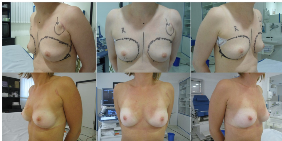
Fig. 2. Cosmetic result, bilateral NSM no radiotherapy.